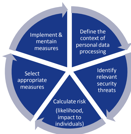
Figure 3: Security risk management for personal data

Appropriate technical and organisational controls will finally be adopted to manage the risks, taking into account the specificities relating to personal data.