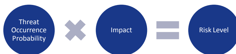
Figure 4: Final risk evaluation

After evaluating the impact of the personal data processing operation and the relevant threat occurrence probability, the final evaluation of risk is possible, as shown in Figure 4 and Table 6 below.